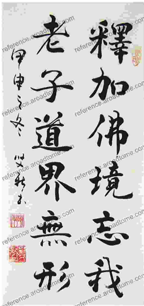
Chinese Calligraphy Arts - Running Hand Vol. 201: Chinese Calligraphy Arts: Running Hand Vol. 201

Discover the Elegance and Expression of Running Hand Script