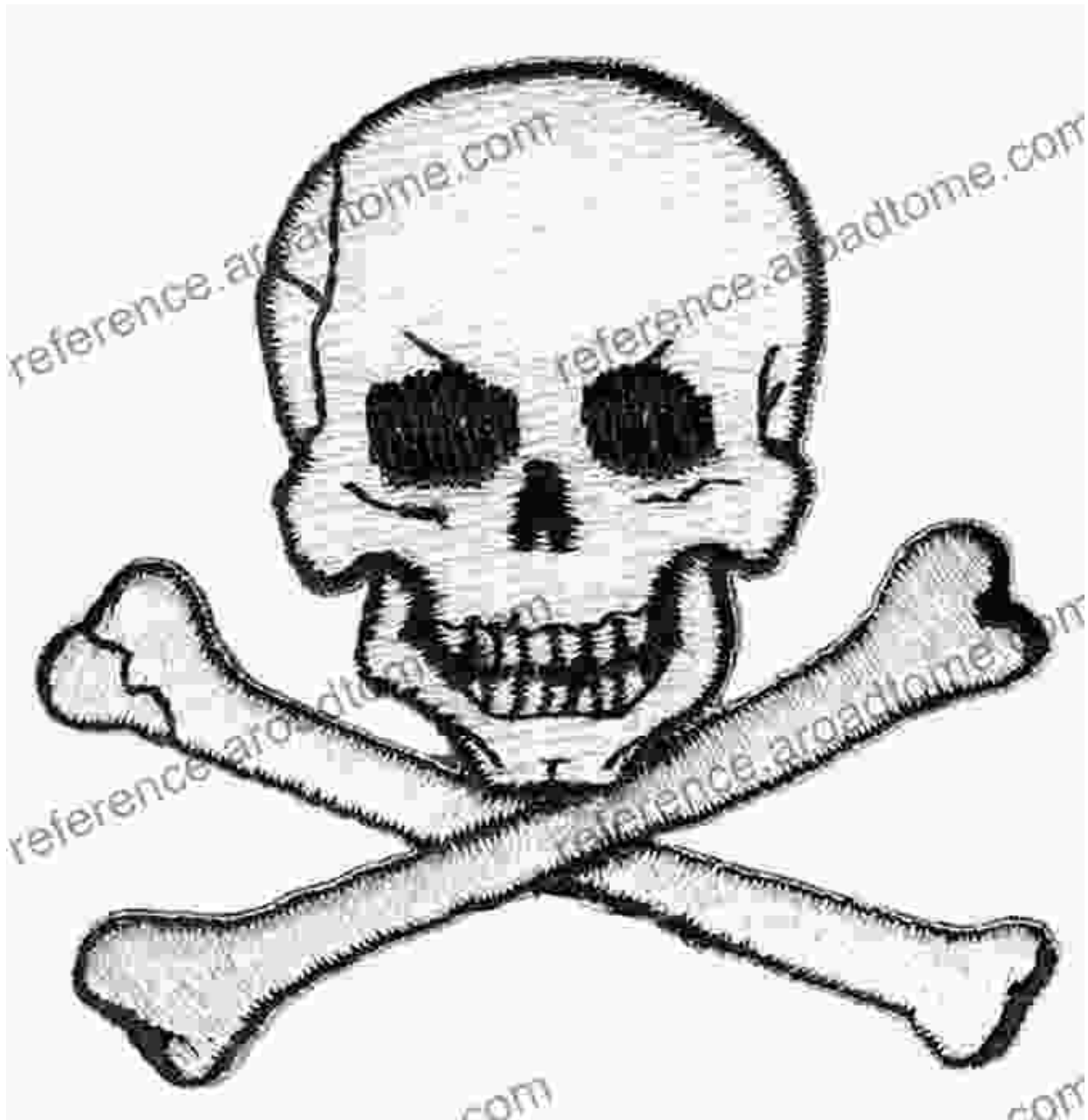
A classic black skull crossbone design embroidered on white fabric.