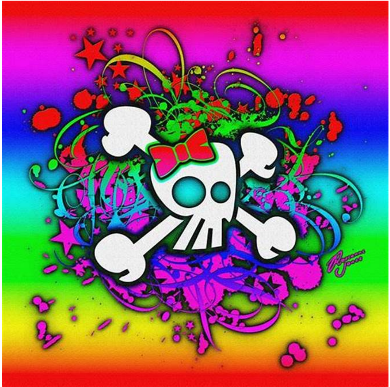
A vibrant skull crossbone design appliquéd with colorful fabric onto black fabric.